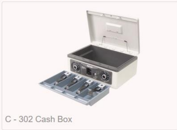
C - 302 Cash Box